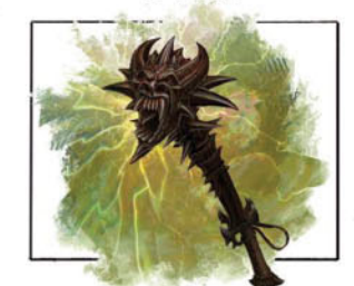
This mace causes 2BO damage to your opponent.