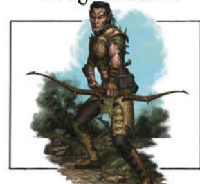
This short bow, equipped with a dragon's sinew, will cause 2BO of damage.