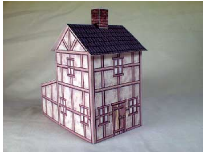
The finished Vyllage House.

the back wall on the upper story. To construct the chimney, fold into a box and glue the tab to the inside. Fold down all tabs along the top edges, apply glue and fold down the top of the chimney in place. Fold up the tabs on the bottom edges of the chimney, apply glue and place on the roof as desired.